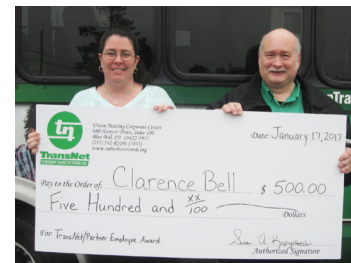
Clarence Bell Valley Paratransit